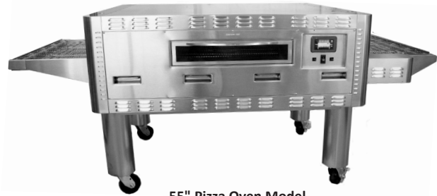
55" Pizza Oven Model