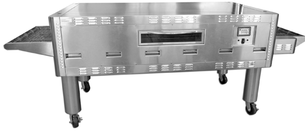
80" Pizza Oven Model